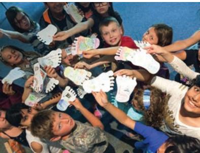
Summer reading club fun