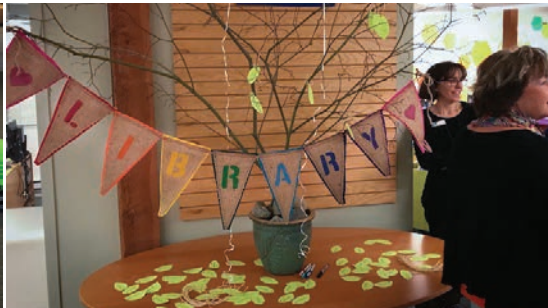
Library wishing tree