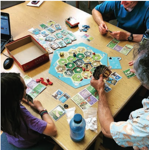
Board Game Club