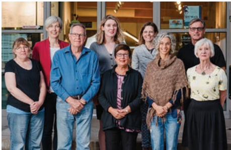
Squamish Public Library Board