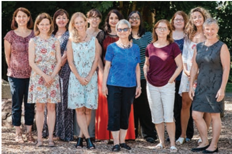
Squamish Public Library Staff

2017 was another good year for our library. With the addition of services such as after-school programs and lynda.com, increased efficiencies to our interlibrary loan service, and new furnishings for our book displays and meeting room, we improved access and ease of use for our patrons. We also engaged our community to find out if our library services are meeting their needs and what more we might offer in the future. The responses were supportive, enthusiastic and innovative and will drive the strategic planning we are undertaking in the year to come. We look forward to 2018 activities, including expansion of our open hours, additional work/study seating and a new vision for our library via our new strategic plan. We feel very fortunate to live in a community that understands the importance of a strong library to the well-being of the community.