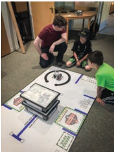
After school robotics club